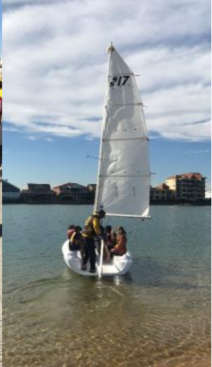
Canoeing: 3+ people in a canoe Sailing: Windy weather + boat = scary boat ride